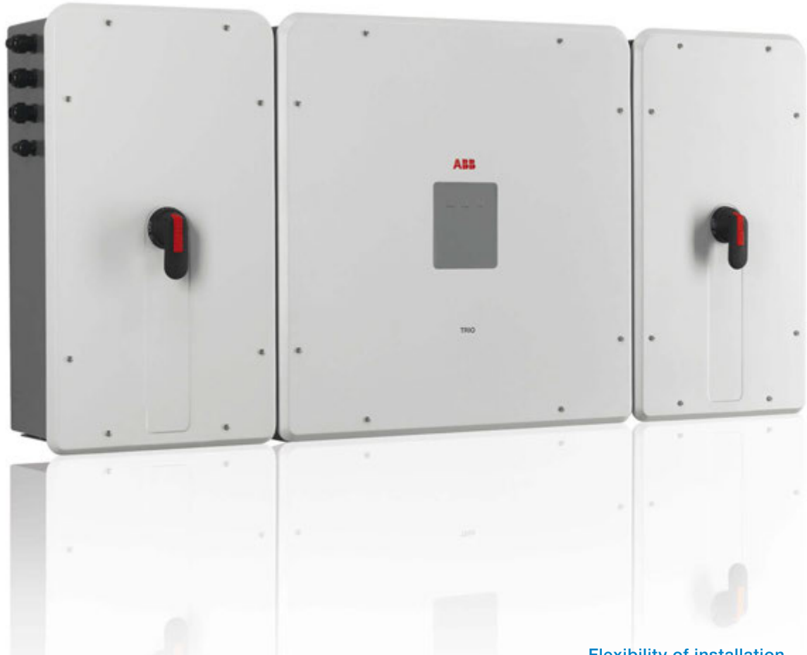
ABB string inverters TRIO-50.0-TL-OUTD 50 kW

The new TRIO-50.0 inverter is ABB's three-phase string solution for cost efficient large decentralized photovoltaic systems for both commercial and utility applications.