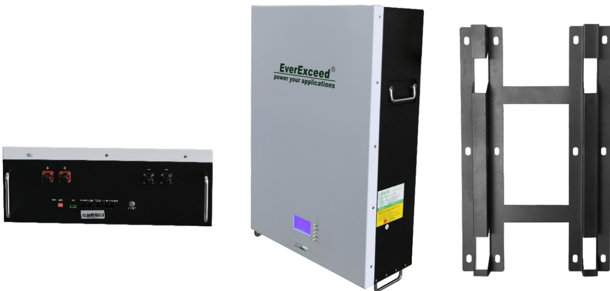
EverExceed 48V Wall mounted Solar lithium iron phosphate (LiFePO4) battery .

* Communication matching other brands of inverters can be customized